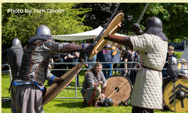
Vikings! Living History, Saturday at The Green 2–4pm

A contemporary, improvised dance installation. Come and go as you please.