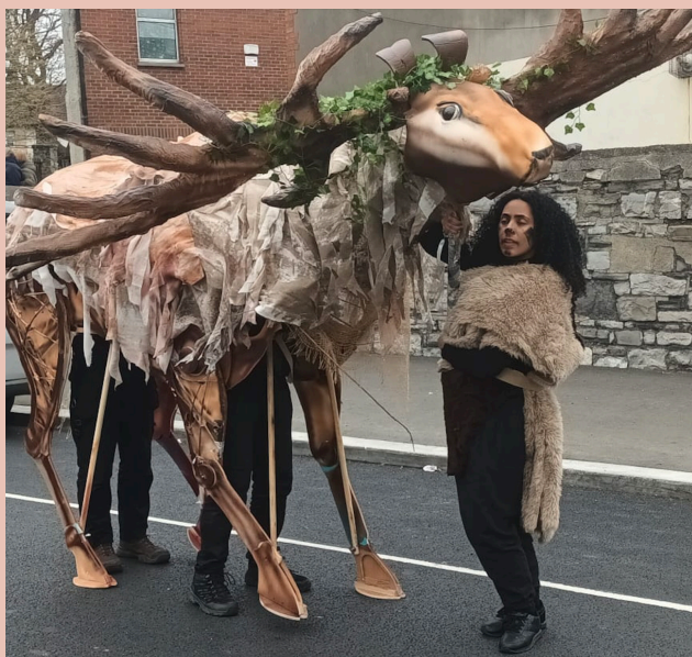
‘Near and Deer’ Sunday at Fairgreen 1–6pm